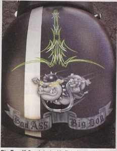
Big Dog K-9 painted with flat clear and hand pinstriped.